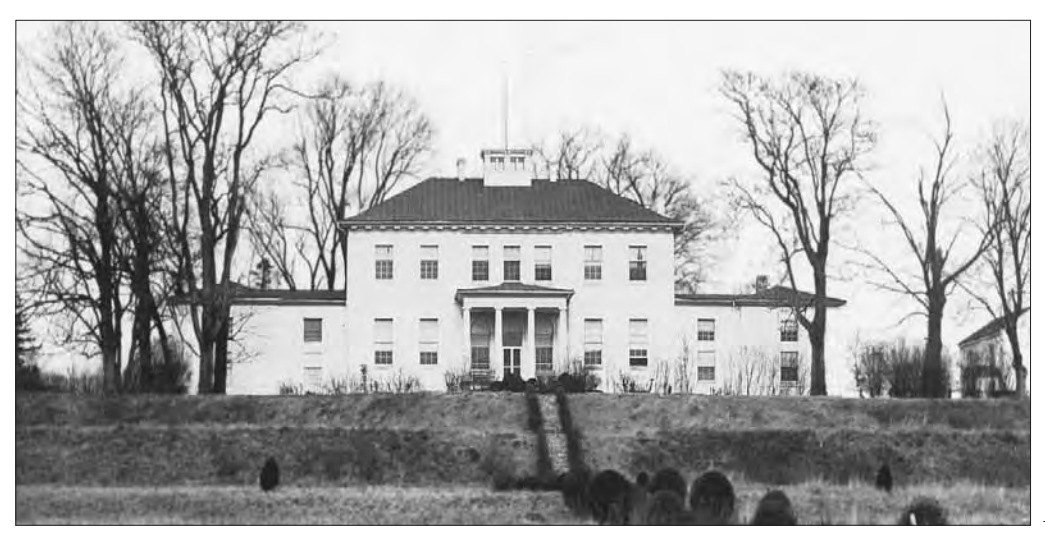
Rear view of Riversdale

has served as the offices of the town developer, the home of senators, and eventually as M-NCPPC office space. After decades of heavy use, Riversdale fell into disrepair by the late 1960s. The Riverdale Historical Society spearheaded the mansion's restoration. This work began in 1990, and the mansion was restored and reopened to the public in 1993. Today, Riversdale is recognized as a valuable and unique source of identity and a focal point of the town.