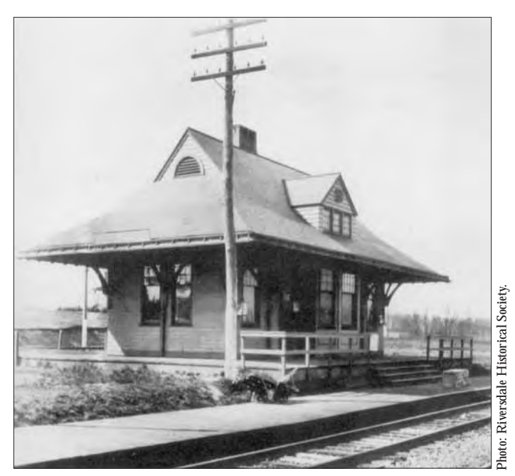
Original Victorian rail station.