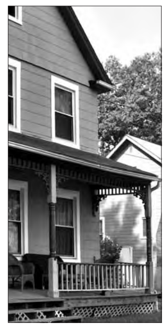
Early Riverdale Park residential development.

should look to Riverdale Park's architectural heritage as a template for quality development. The town reflects all the historical styles of the early- to mid-twentieth century. New architecture on the street should not be restricted to one particular historical style, as this would not accurately reflect the historical development of the town. Riverdale's architectural heritage is rich, precisely due to the variety and quality of styles represented. New development should seek to incorporate that variety into the buildings and streetscapes while also being sensitive to the residential character of the surrounding town and the historic fabric of its core.